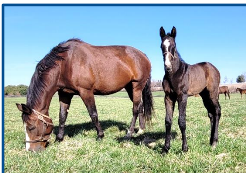
Cairo Prince – Clara Barton Gray filly Foaled: 3/9/22 Breeder: Endeavor Farm