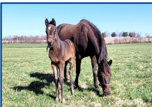
Omaha Beach – Arch of Troy Bay filly Foaled: 3/8/22 Breeder: Endeavor Farm