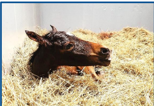
Gun Runner – Reverse Bay colt; Foaled: 3/21/22 Breeder: Wolverton Mountain Farm