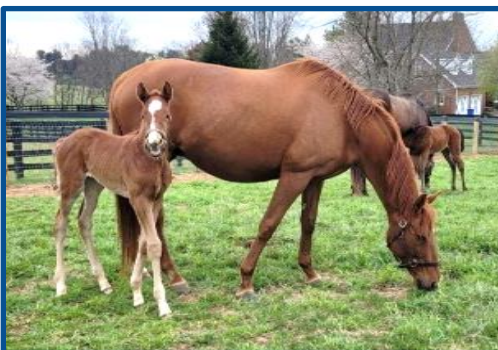
Oscar Performance – Swear by It Chestnut filly Foaled: 3/24/22 Breeder: Circle Bar H