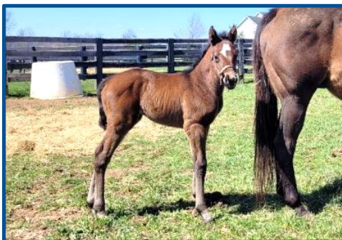
Accelerate – Ocean Road Bay filly Foaled: 3/25/22 Breeder: T. L. Wise