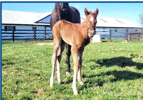
Vekoma – Delitefull Lady Chestnut filly; Foaled: 3/20/22 Breeder: Paymaster Racing