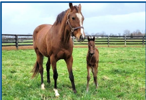
Goldencents – Andrea’s Pride Bay filly; Foaled: 3/21/22 Breeder: JRita Young Thoroughbreds