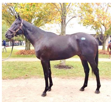
Laban M Mo as a yearling in 2020